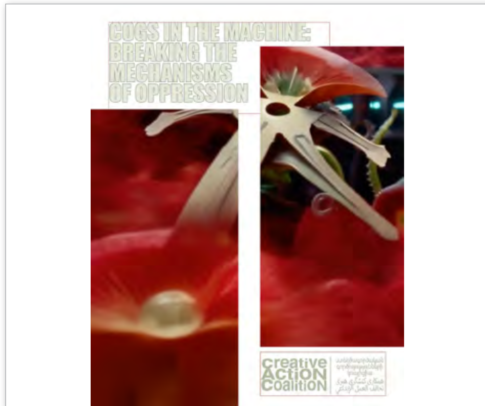
The Cogs in the Machine” catalog

To participate in this project, send the following information using the link above. In the subject box write: “Ayb-Ben: Your