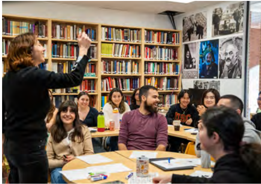
Students at Armenian Language Immersion Class