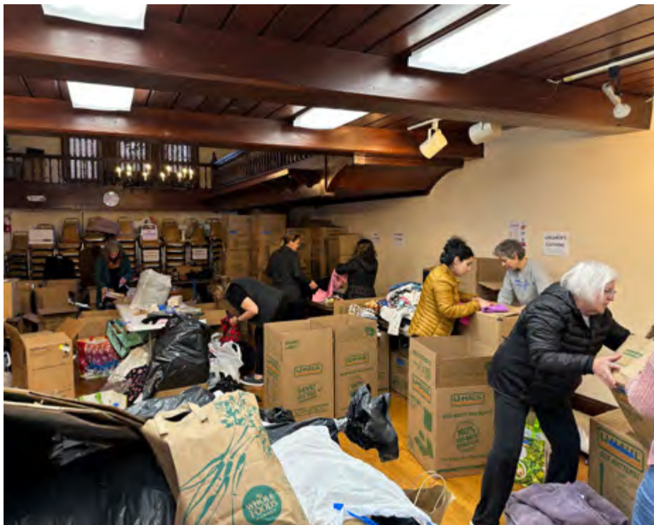
Volunteers helping sort and pack clothing at Holy Trinity Armenian Church

At the local City Municipal Building of Geti Village