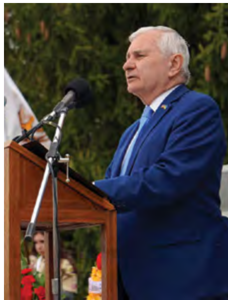
Sen. Jack Reed