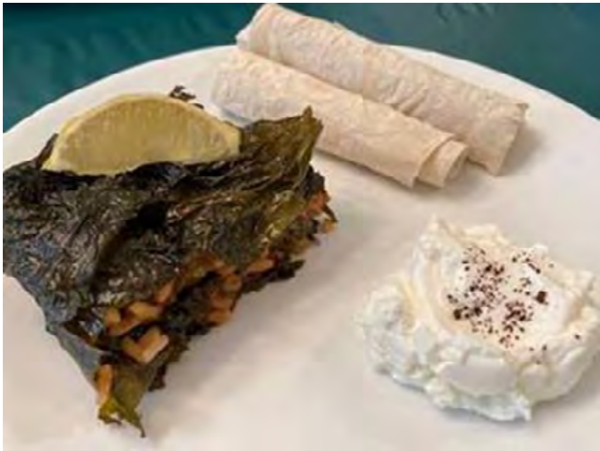
Shirdov Sini Sarma served with plain Armenian or Greek yogurt dusted with ground sumac and Armenian lavash