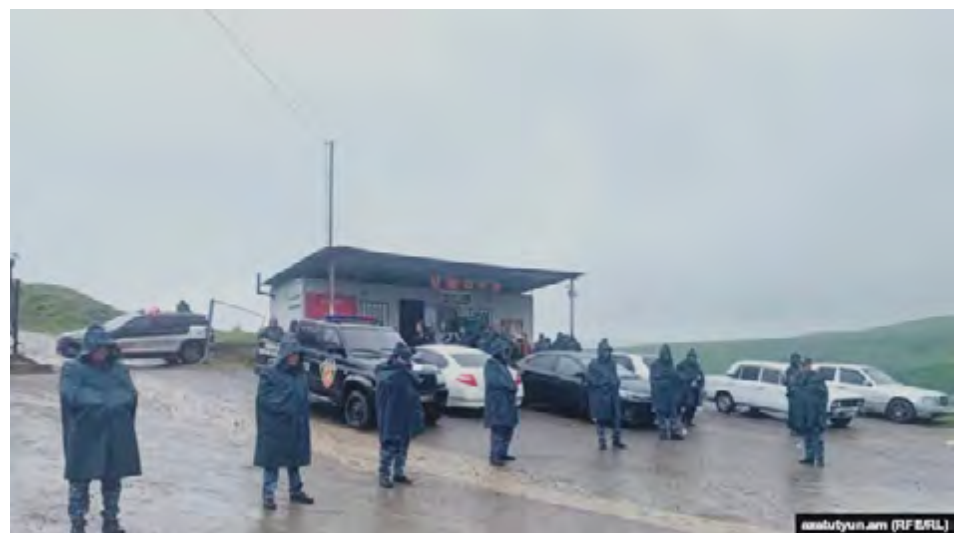
Police stand guard in Kirants village, May 4, 2024.