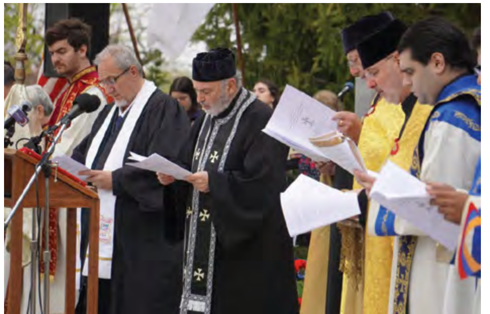
Members of the clergy