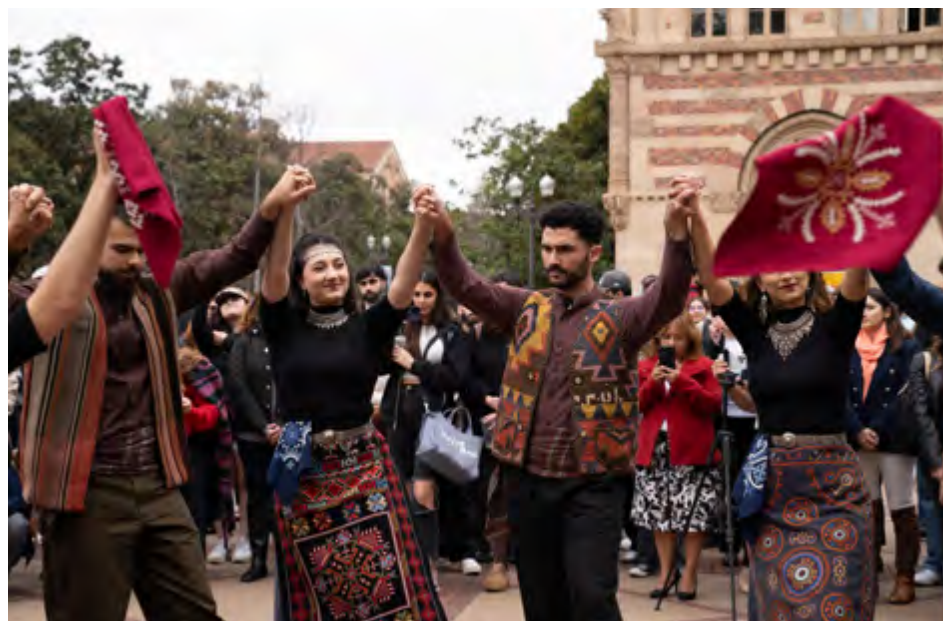
Lernazang Performing at USC