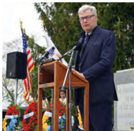
Sen. Sheldon Whitehouse

Following the guest speaker and much to the delight of the audience of approximately 250, the Armenian School children of