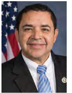
Rep. Henry Cuellar (D-Texas)